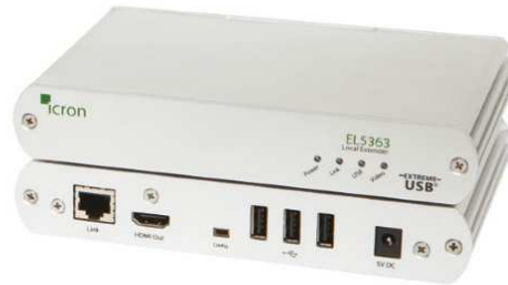
LEX (Local Extender) front view

The EL5363 KVM Extender System features the latest and most robust HD video and USB extension technology from Icron Technologies. The EL5363 extends both HDMI and USB 2.0 up to 100m using a single Cat 5e/6/7 cable.